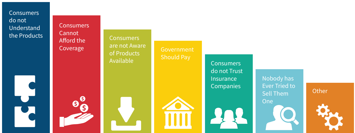
Figure 1 Top Reasons That Prevent Consumers From Buying Personal Lines Property Damage Coverage

economically developed countries. Insurance losses were estimated at $380 million, but economic losses were as high as $3.1 billion, for an insurance coverage of 12 percent.